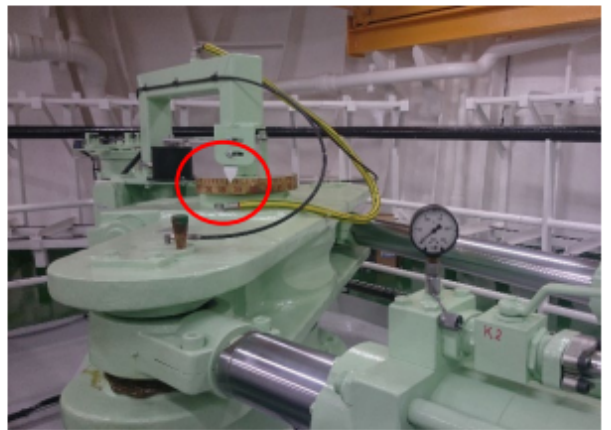
Actual Position of the Rudder