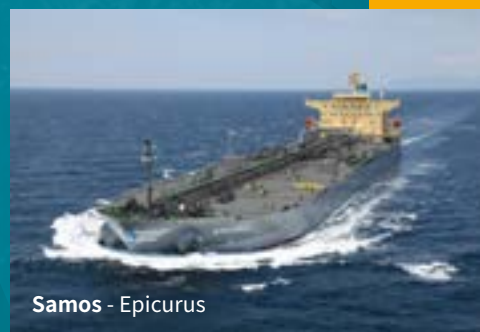
Samos - Epicurus