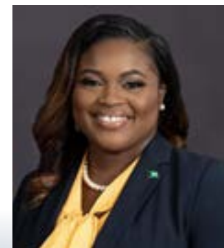
Hon. JoBeth Coleby-Davis MP Minister for Transport & Housing

We welcome the opportunity to showcase our services, share experiences, meet industry partners and reconnect with valued clients at Posidonia. The BMA team invites you to visit us on Stand No. 2.208 and enjoy our Bahamian hospitality.