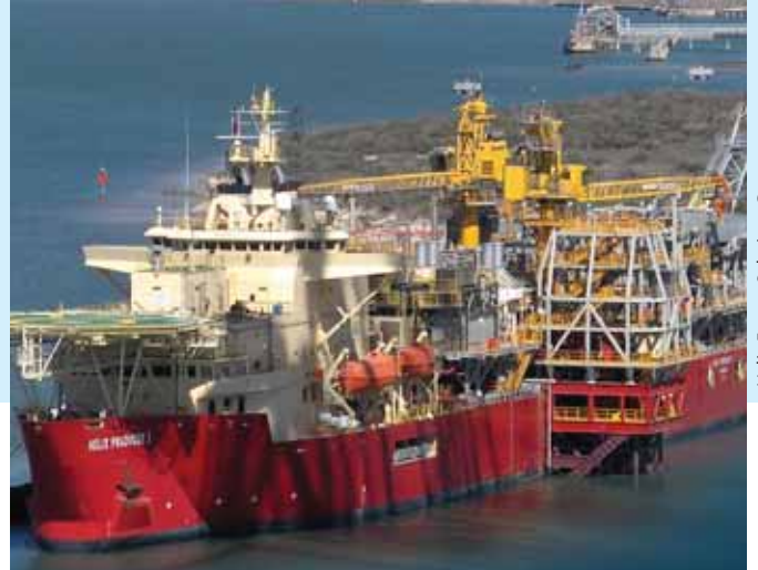
Helix Energy Solutions Group

Helix Energy Solutions Group vessels and technologies played a key role in the BP Macondo oil spill response and well kill operation in the Gulf of Mexico.