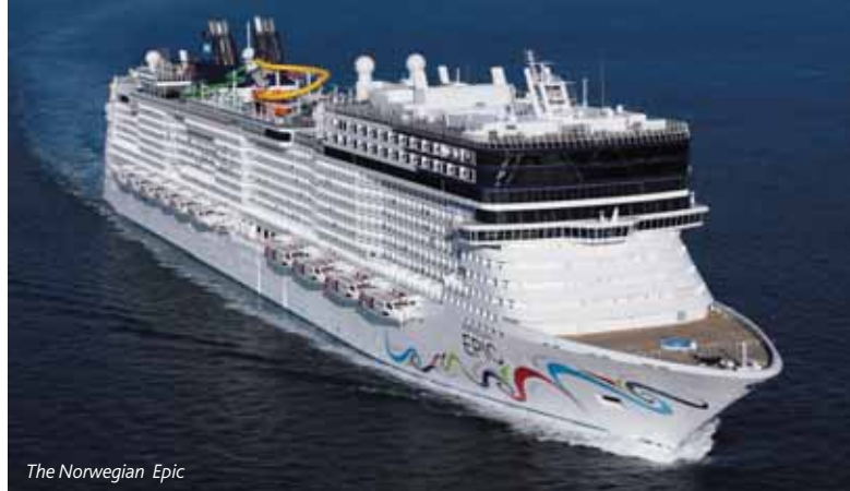
The Norwegian Epic

In the coming months Norwegian Epic will undertake year-round Caribbean sailings featuring ports of call alternating between an Eastern Caribbean itinerary and Nassau, Bahamas and Western Caribbean cruises. The 2011 cruise season from May-October will have Norwegian Epic sailing a series of 7-day Western Mediterranean cruises from Barcelona. Returning to Miami in November 2011, she will sail a series of 7-day Eastern Caribbean cruises in 2012.