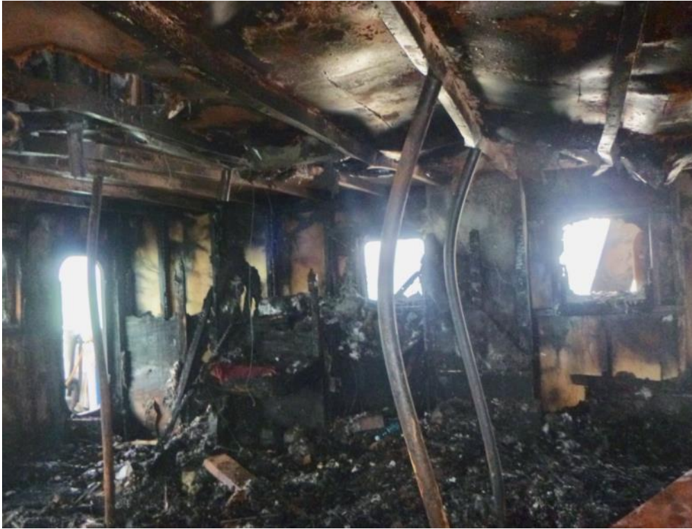
Figure 13: Cabin and accommodation area after the fire