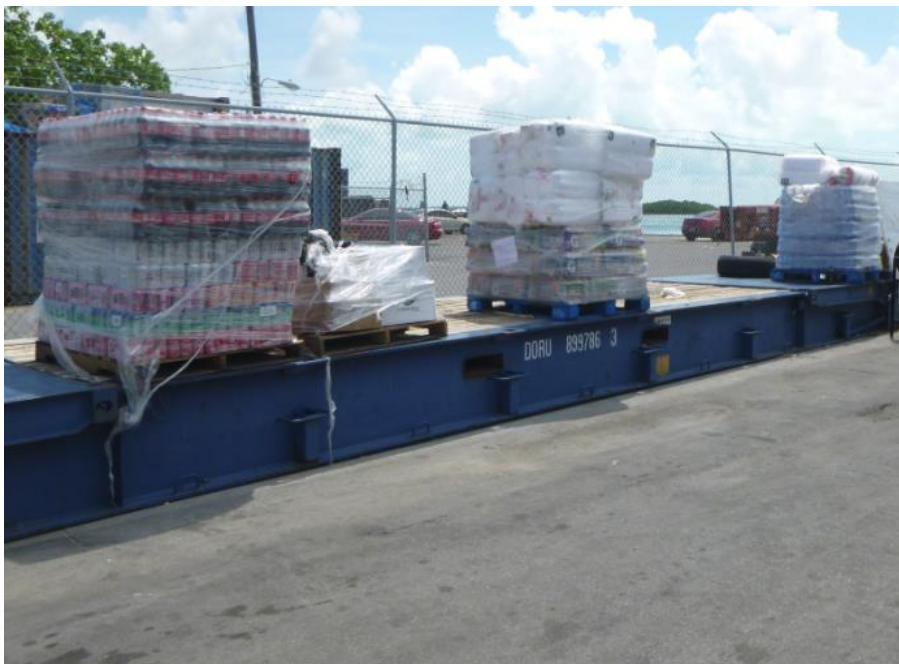
Figure 3: Cargo carried on another vessel from Bimini, similar to cargo that was carried on m.v. Sherice M

3.3.2 The vessel was certified by the Bahamas port department to carry a maximum of 50 passengers.