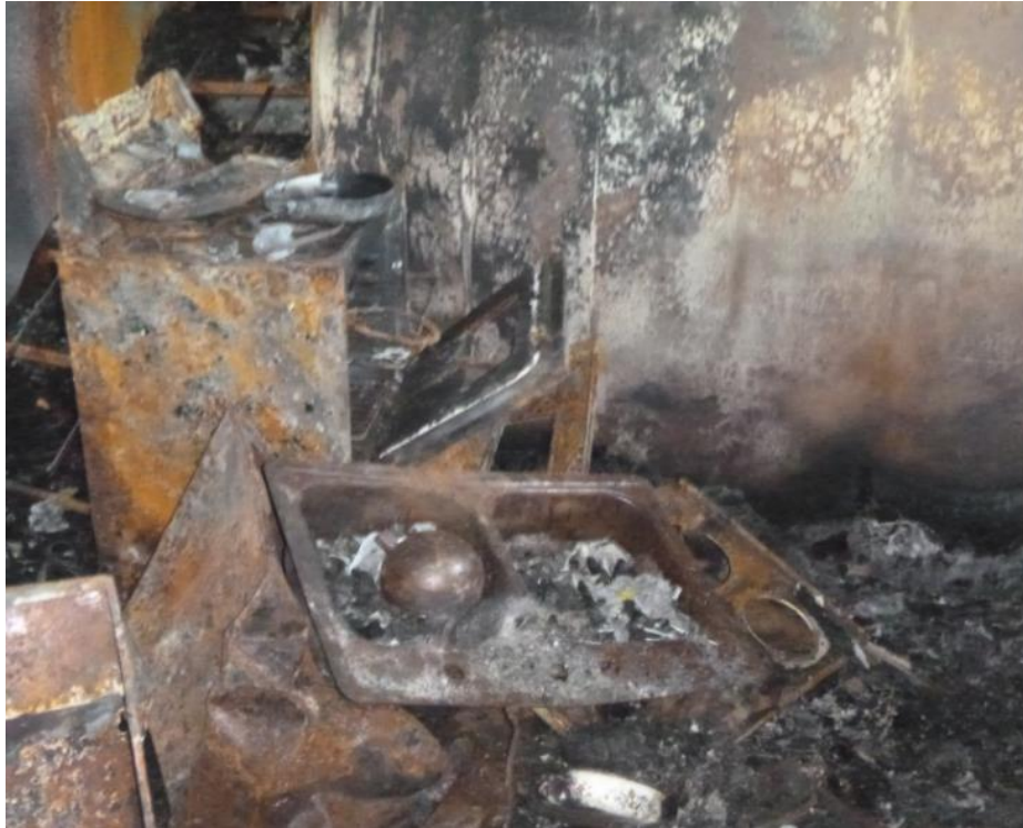
Figure 9: Picture of the stove after the fire was extinguished

confirmed as to the position of the knobs, to determine whether the stove was in an 'on' or 'off' condition.