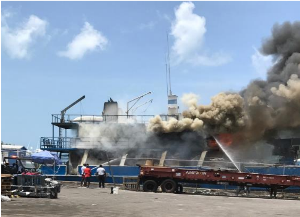
Figure 10: Firefighting efforts by resort world fire team