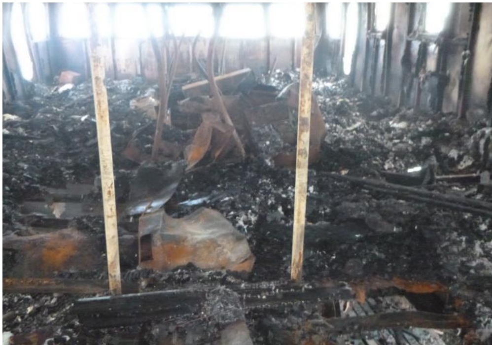
Figure 14: Bridge and Master's cabin area after the fire