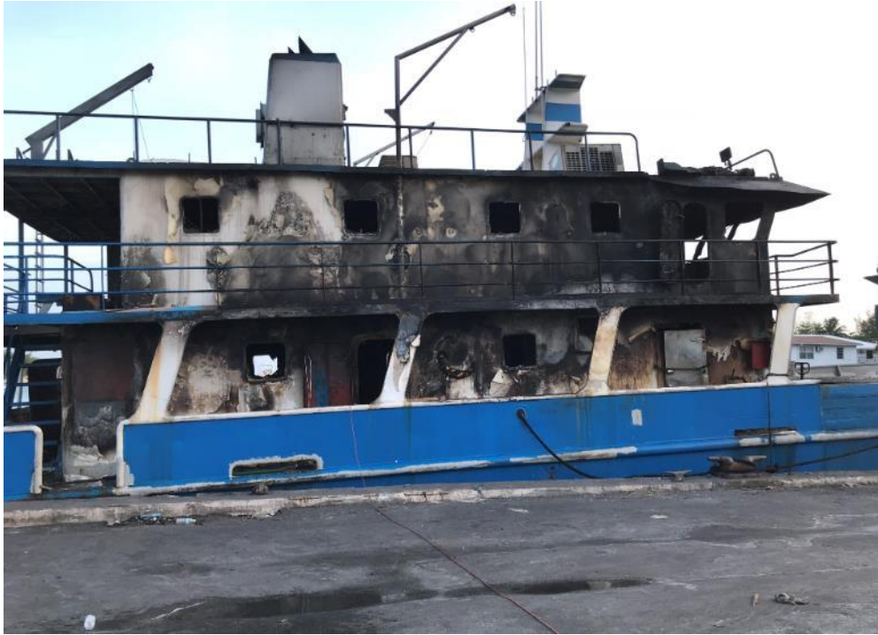
Figure 7: Vessel condition after fire was extinguished