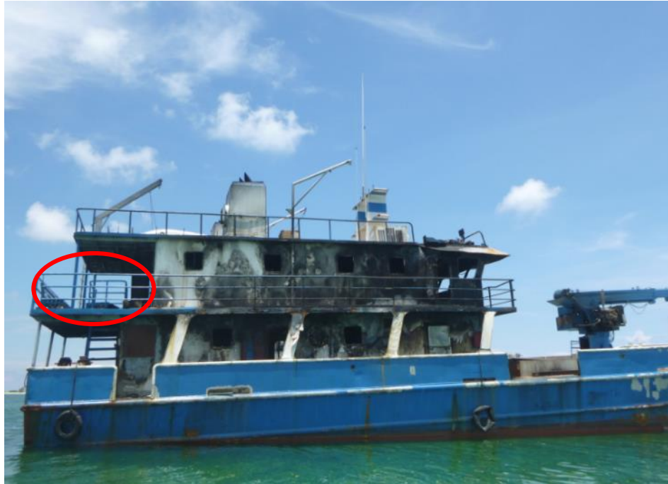
Figure 5: Location of firefighting equipment