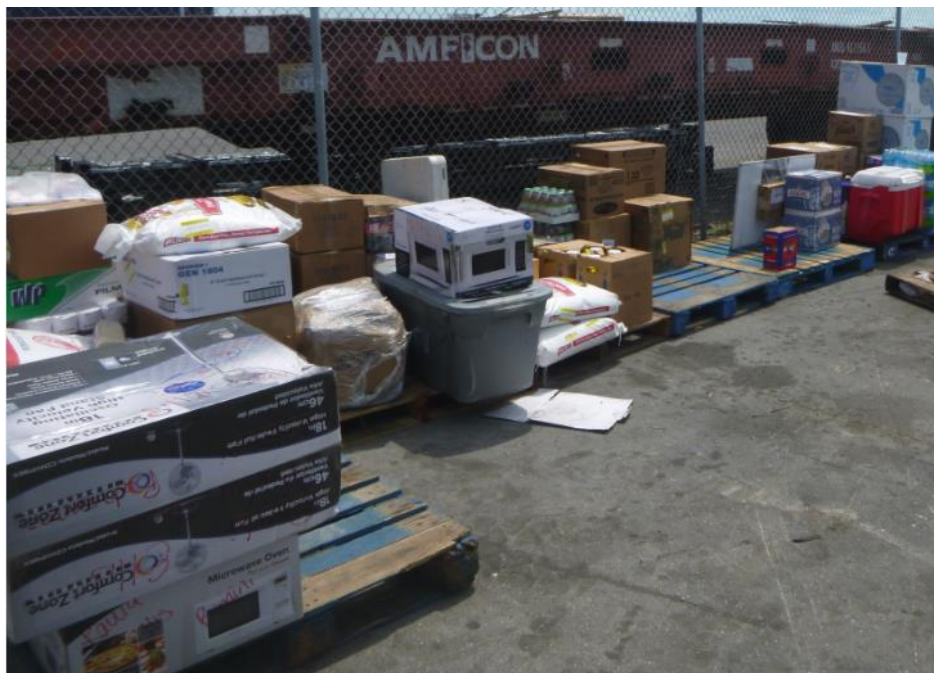
Figure 1: Cargo carried on another vessel from Bimini, similar to cargo that was carried on m.v. Sherice M