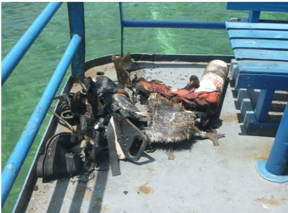
Figure 6: Unused firefighting equipment after fire