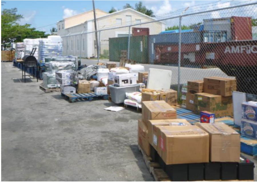
Figure 2: Cargo carried on another vessel from Bimini, similar to cargo that was carried on m.v. Sherice M