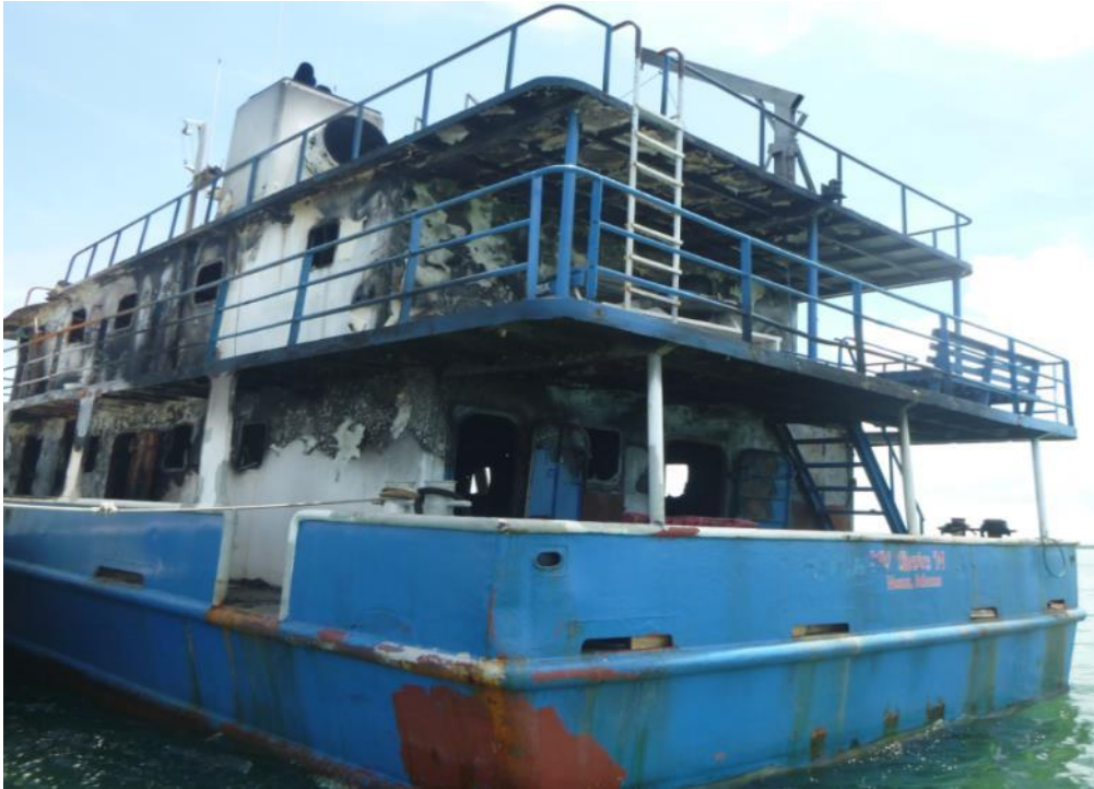
Figure 11: Superstructure after the fire