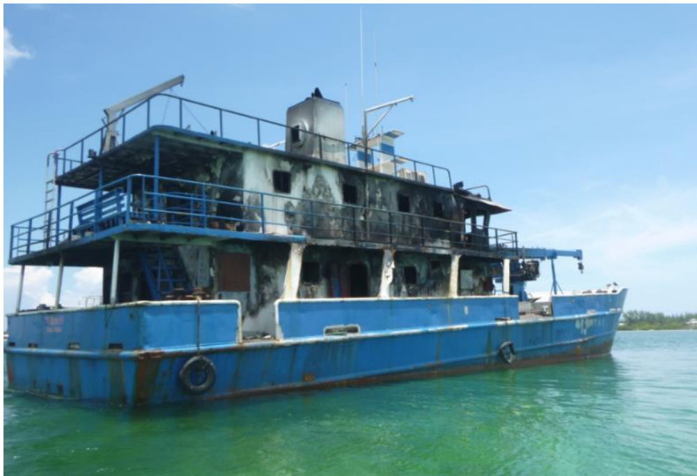
Figure 12: Superstructure after the fire