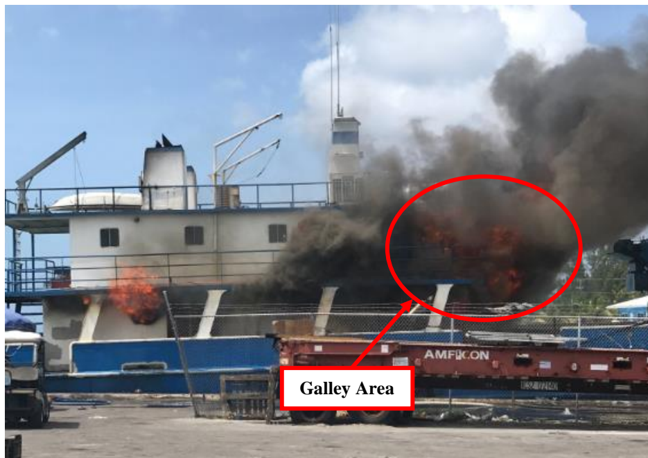
Figure 8: Fire location