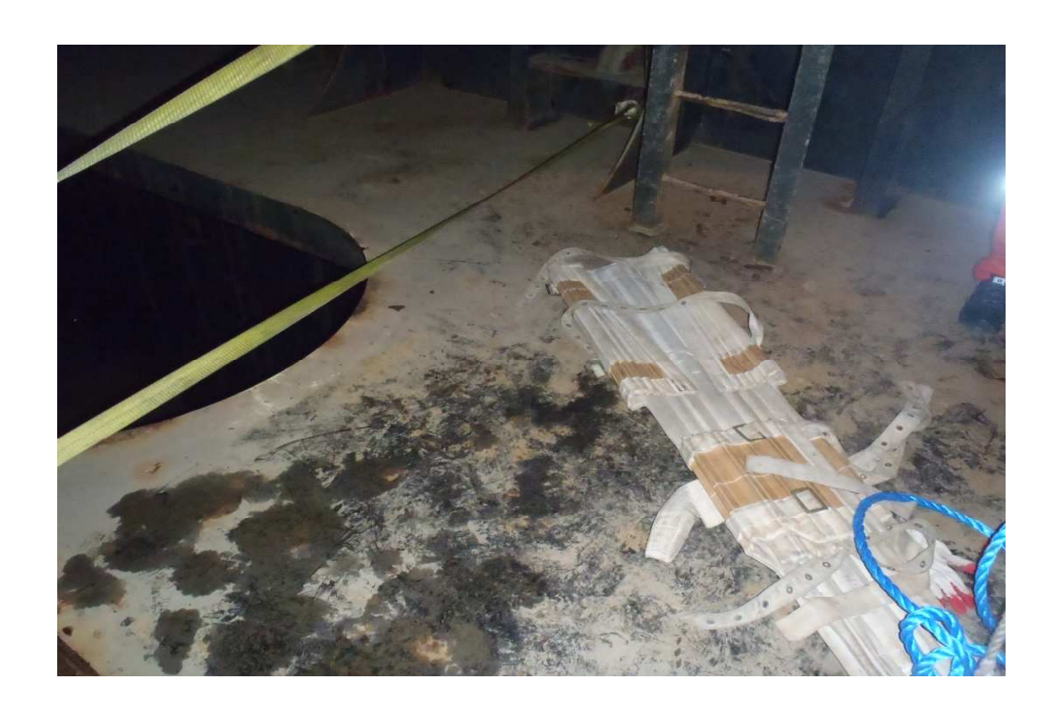
Appendix I: No. 4 Port Ballast Tank 1<sup>st</sup> Stringer Platform (Note: Location of simulated casualty and proximity to plate opening)